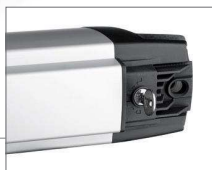
Individual key for declutching